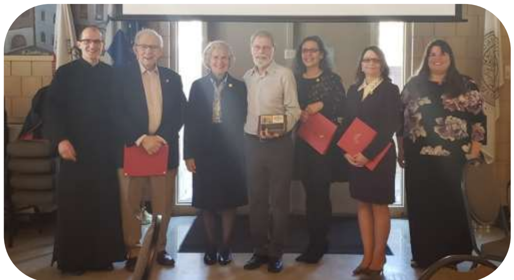
Recipients of the St. George Pin and Bronze Cross. An initiative of the Metropolis.