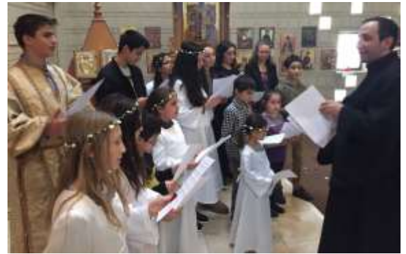
Descent from Cross Vespers