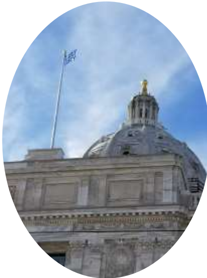
Greek flag over the State Capitol building on March 25, 2018