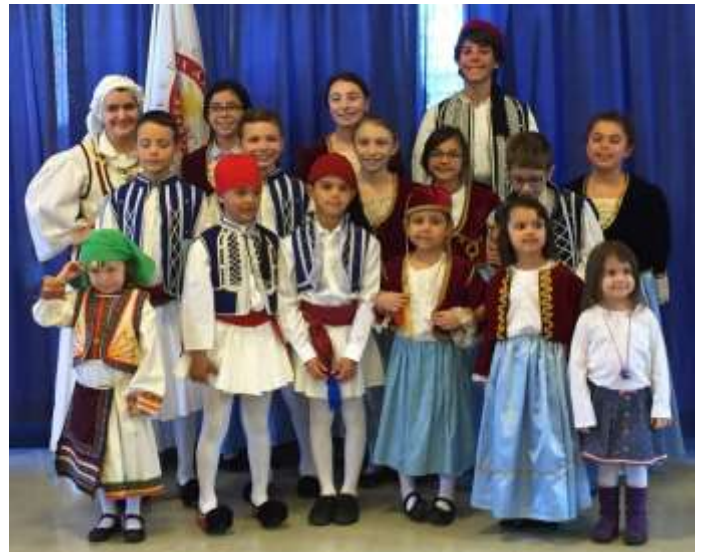
Greek School students performed on Independence Day, March 25, 2018.

Save the Date: Sunday, June 3, 2018, at 11:30am , come join the Greek school at our "end of the year" party! We plan to do a potluck, so bring a dish to share. Participate in Greek games that kids in Greek schools play at recess. There will also be some craft making. You do not need to speak Greek to participate; all ages welcome. Children should be accompanied by an adult. Refreshments will be provided.