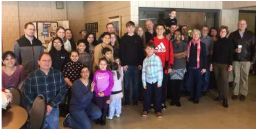
Lazaros Saturday youth retreat