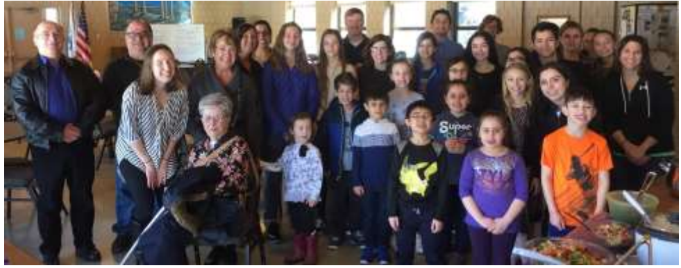
Holy Friday youth retreat