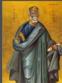
Apostle Simon the Zealot May 10