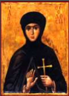
Saint Theodosia May 27

Please donate a Festal Icon (11" x 14") in memory of a loved one. The cost is $75.00 per icon. The icons are displayed in the church nave and are put out for veneration on the Feast Day of the Saint or event they represent. To donate an icon, fill out a form (found on the revolving bulletin board in the social hall) and return it to the office.