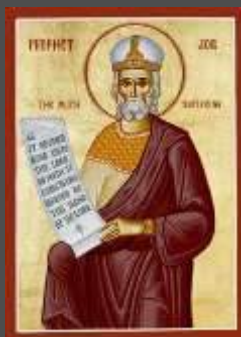
Prophet Job May 6